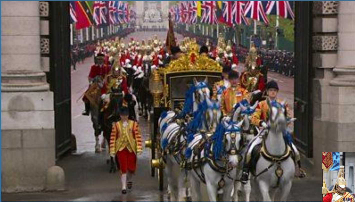
On the way to Westminster Abbey