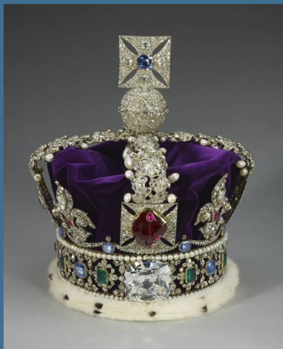
Imperial State Crown