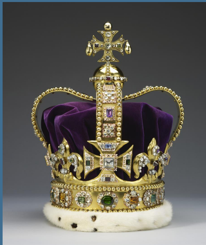
St Edward's Crown